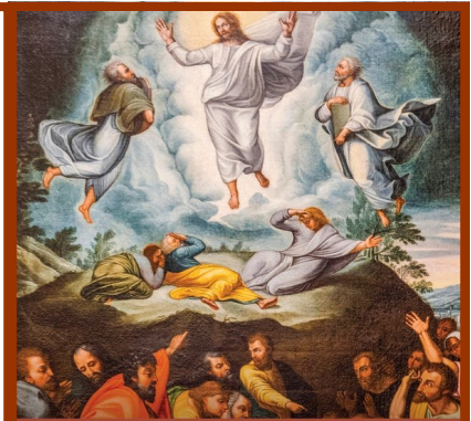
THE TRANSFIGURATION OF THE LORD

Jesus took Peter, James, and his brother, John, and led them up a high mountain by themselves. And he was transfigured before them; his face shone like the sun and his clothes became white as light. - Mt 17:1-2